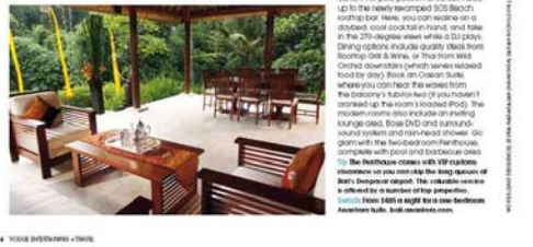
184 YOUR DISCOVERY TRIP

ANANTARA SEMINYUR RESORT & SPA, BEACHSIDE COOL Anantara Seminyur Resort & Spa is a modern, minimalist design that blends seamlessly with the natural surroundings. The house features a large, open-plan living area with a high ceiling and a large window that looks out onto the ocean. The interior is furnished with contemporary pieces, and the overall atmosphere is one of relaxed elegance.