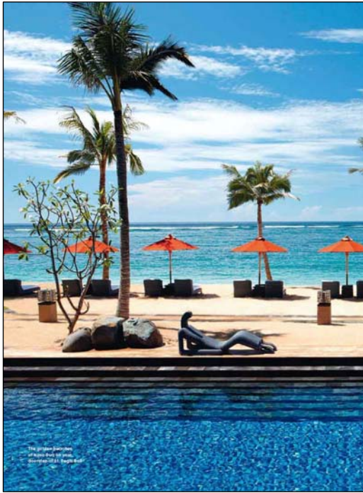
The golden beaches of Bali are a sight to behold.